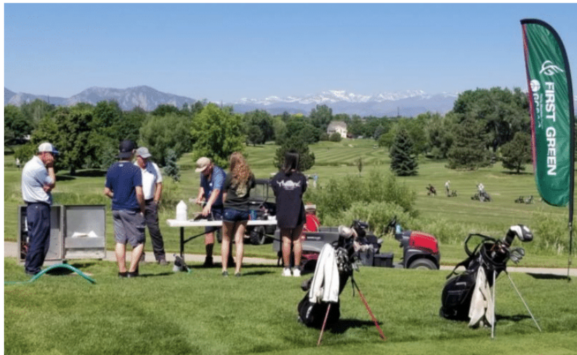
First Green at Indian Peaks Golf Course

Not in any particular order, here is my list of new and improved GCSAA programs that I encourage you to take advantage of.