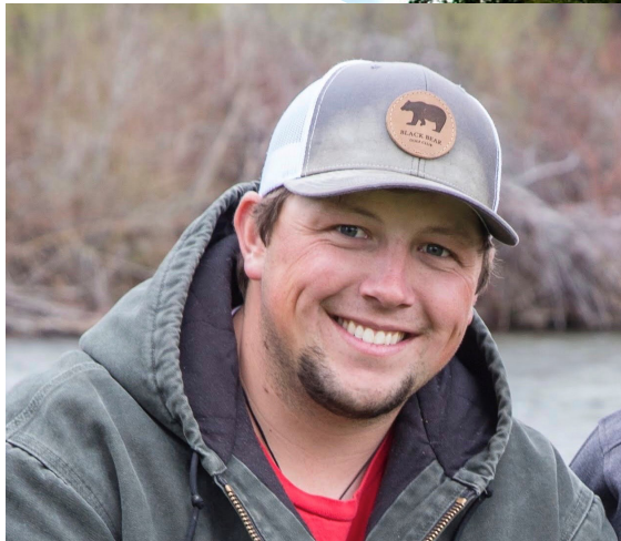
Hunter Dorsey Black Bear Golf Club. Parker, CO