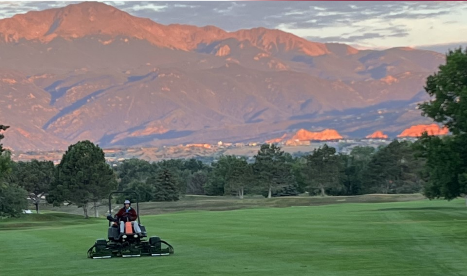
Hole #2 at the Colorado Springs CC